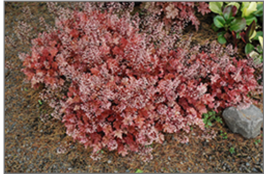
Peach Crisp Coral Bells in bloom

Peach Crisp Coral Bells is recommended for the following landscape applications;