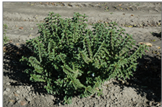
Pucker Up Red Twig Dogwood