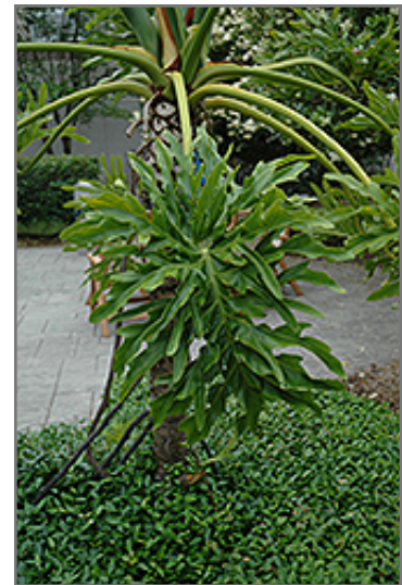
Tree Philodendron foliage