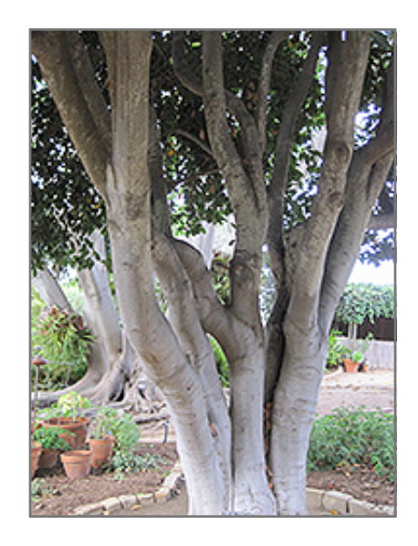
Bay Laurel bark

This tree does best in full sun to partial shade. It does best in average to evenly moist conditions, but will not tolerate standing water. It is not particular as to soil type or pH. It is somewhat tolerant of urban pollution. This species is not originally from North America. It can be propagated by cuttings.