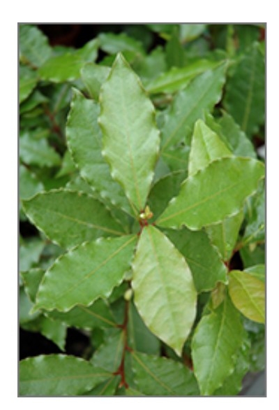
Bay Laurel foliage

8424 Farley St. Overland Park, KS 66212 913.642.6503