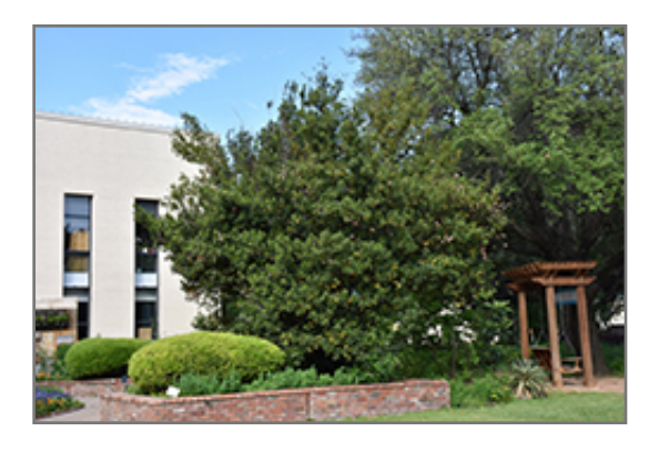
Bay Laurel

This is a relatively low maintenance tree, and can be pruned at anytime. It is a good choice for attracting bees and butterflies to your yard, but is not particularly attractive to deer who tend to leave it alone in favor of tastier treats. It has no significant negative characteristics.