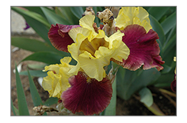
Blatant Iris flowers

830 W Liberty Dr. Liberty, MO 64068 816.781.0001