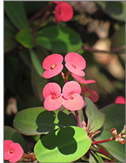
Crown Of Thorns flowers

Crown Of Thorns is recommended for the following landscape applications;