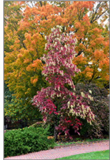
Sourwood in fall

This tree does best in full sun to partial shade. It does best in average to evenly moist conditions, but will not tolerate standing water. It is very fussy about its soil conditions and must have rich, acidic soils to ensure success, and is subject to chlorosis (yellowing) of the foliage in alkaline soils. It is quite intolerant of urban pollution, therefore inner city or urban streetside plantings are best avoided, and will benefit from being planted in a relatively sheltered location. Consider applying a thick mulch around the root zone in winter to protect it in exposed locations or colder microclimates. This species is native to parts of North America, and parts of it are known to be toxic to humans and animals, so care should be exercised in planting it around children and pets.