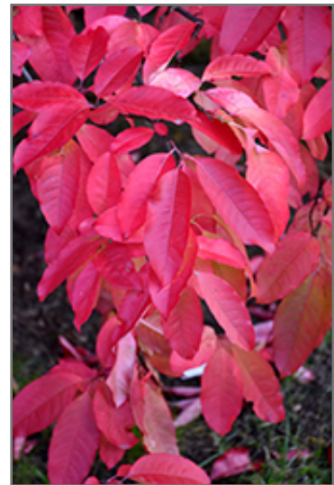
Sourwood in fall