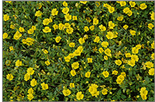
Magic Carpet Yellow Mecardonia flowers

Magic Carpet Yellow Mecardonia is recommended for the following landscape applications;