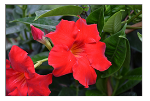
Red Mandevilla flowers

This plant is native to the tropics and prefers growing in moist environments with evenly warm conditions all year round. In our climate, it is usually grown as an outdoor annual in the garden or in a container. If you want it to survive the winter, it can be brought in to the house and provided with special care, and then returned to the garden the following season. In its preferred tropical habitat, it can grow to be around 10 feet tall at maturity, with a spread of 24 inches. However, when grown as an annual or when overwintered indoors, it can be expected to perform differently, and its exact height and spread will depend on many factors; you may wish to consult with our experts as to how it might perform in your specific application and growing conditions.