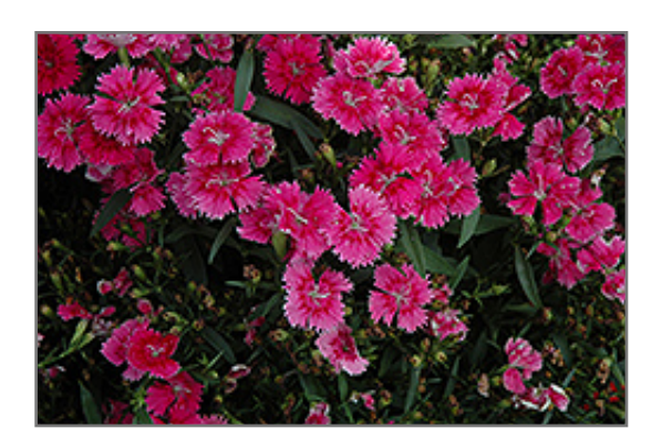
Ideal Select Raspberry Pinks flowers