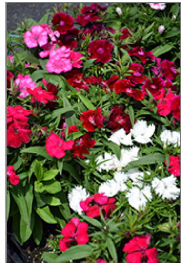
Floral Lace Mix Pinks flowers