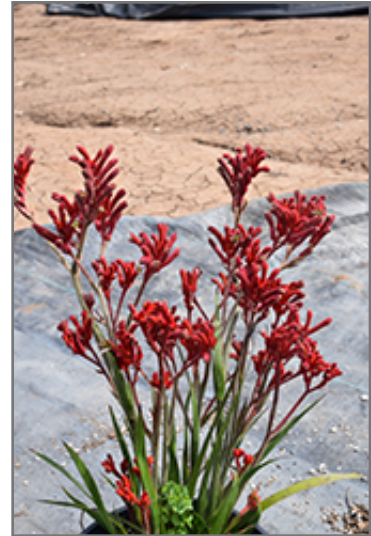
Kanga Red Kangaroo Paw in bloom