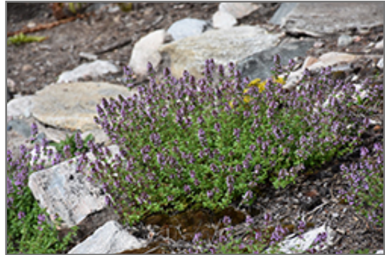
Lemon Thyme in bloom