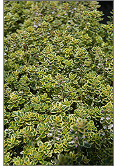
Lemon Thyme foliage

Lemon Thyme is smothered in stunning spikes of lilac purple flowers rising above the foliage from early to late summer. Its attractive tiny fragrant round leaves remain light green in color throughout the year.