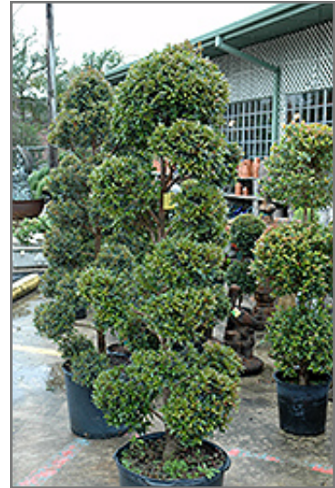
Brush Cherry

Brush Cherry is recommended for the following landscape applications;