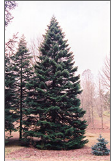
Nordmann Fir

Nordmann Fir will grow to be about 60 feet tall at maturity, with a spread of 25 feet. It has a low canopy, and should not be planted underneath power lines. It grows at a slow rate, and under ideal conditions can be expected to live for 90 years or more.