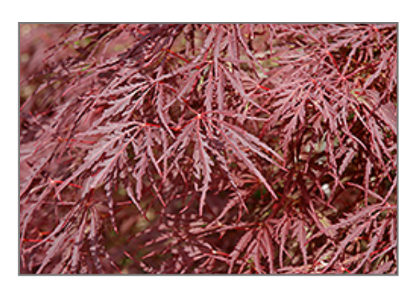
Dissectum Nigrum Cutleaf Japanese Maple foliage

Dissectum Nigrum Cutleaf Japanese Maple is recommended for the following landscape applications;