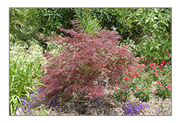
Dissectum Nigrum Cutleaf Japanese Maple

7036 Nieman Shawnee, KS 66203 913.631.6121