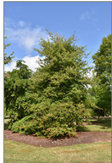
Wildfire Black Gum