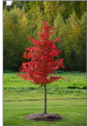
Wildfire Black Gum in fall