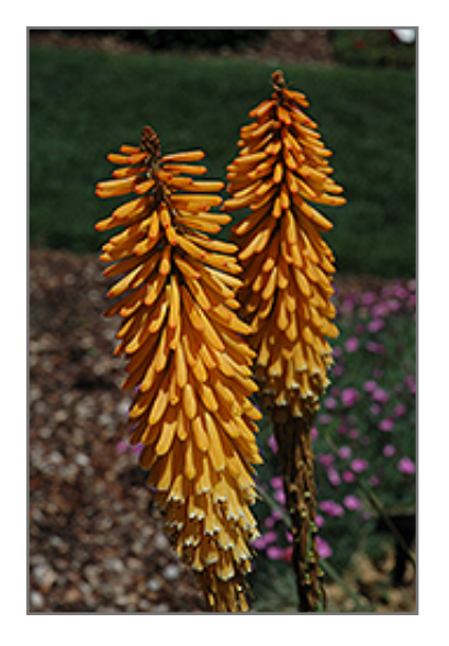
Echo Mango Torchlily flowers

830 W Liberty Dr. Liberty, MO 64068 816.781.0001