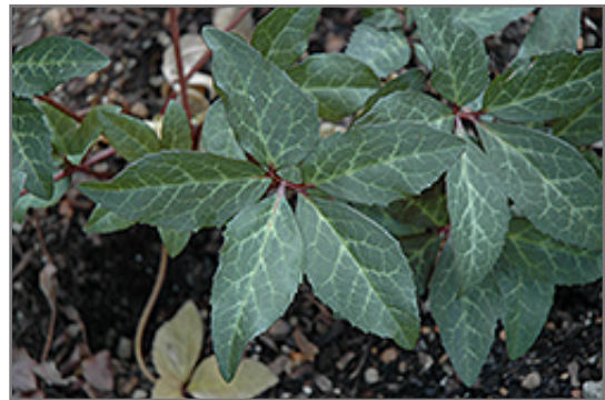
Merlin Hellebore foliage