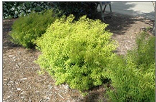
Mellow Yellow Spirea

Mellow Yellow Spirea is recommended for the following landscape applications;