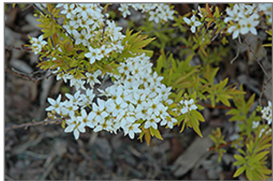
Mellow Yellow Spirea flowers