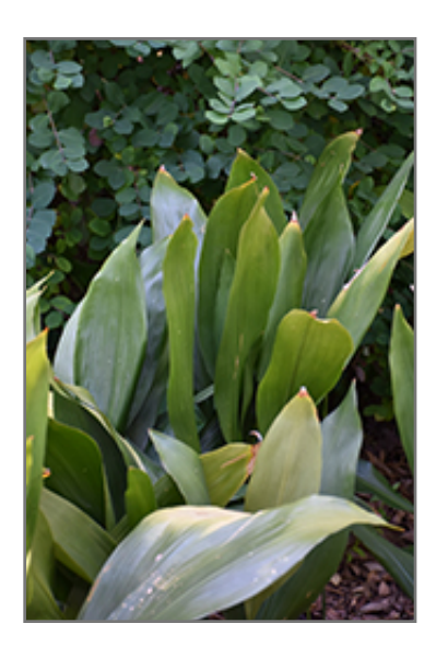
Cast Iron Plant foliage

7036 Nieman Shawnee, KS 66203 913.631.6121