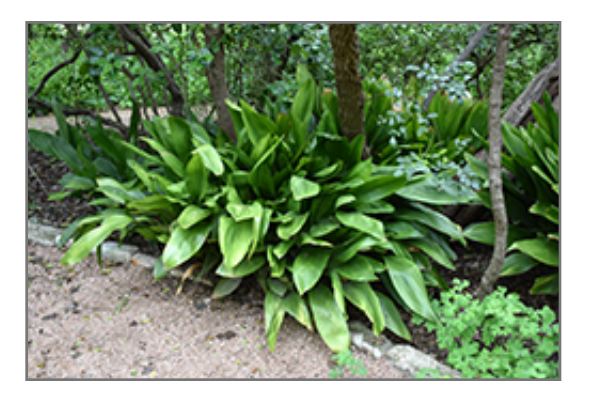
Cast Iron Plant