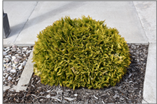
Anna's Magic Ball Arborvitae

Anna's Magic Ball Arborvitae is recommended for the following landscape applications;