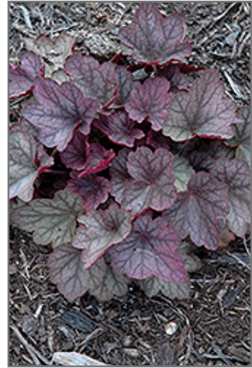
Carnival Rose Granita Coral Bells foliage

Carnival Rose Granita Coral Bells is recommended for the following landscape applications;