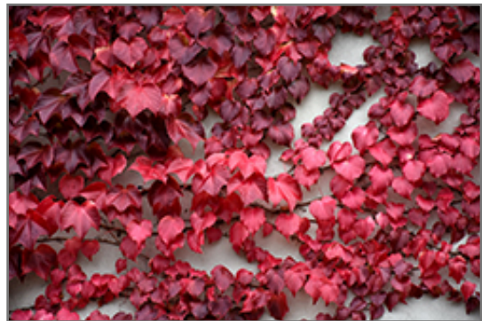
Veitch Boston Ivy in fall