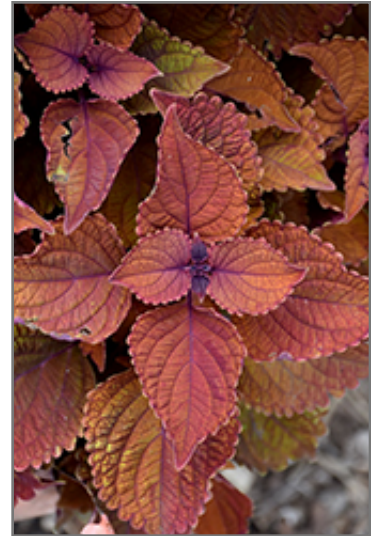
Wall Street Coleus foliage