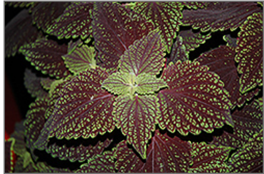
Abbey Road Coleus foliage