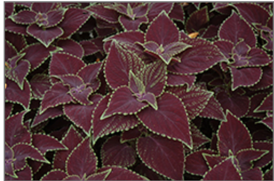
Abbey Road Coleus foliage