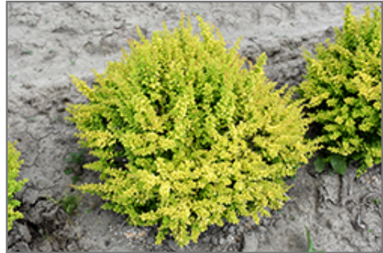
Sunsation Japanese Barberry

Sunsation Japanese Barberry is recommended for the following landscape applications;