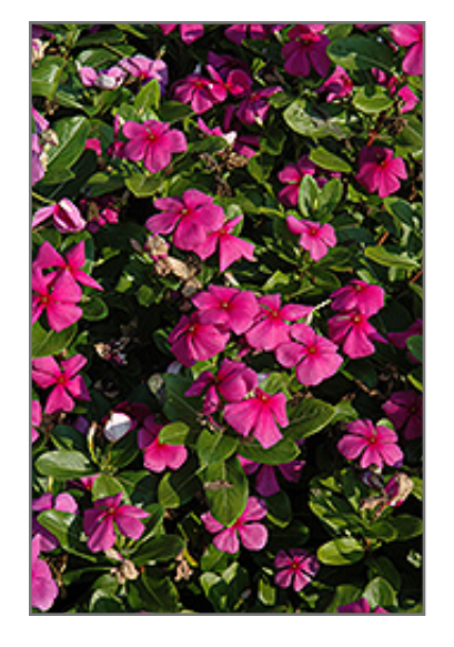
Titan Lilac Vinca flowers

830 W Liberty Dr. Liberty, MO 64068 816.781.0001