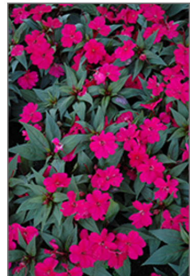
SunPatiens Compact Royal Magenta New Guinea Impatiens flowers