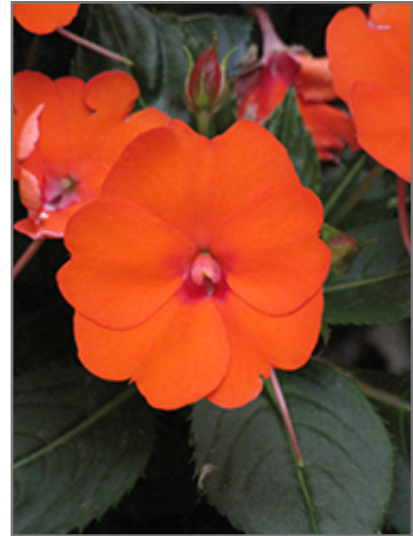
SunPatiens Compact Electric Orange New Guinea Impatiens flowers

This plant will require occasional maintenance and upkeep, and should not require much pruning, except when necessary, such as to remove dieback. It is a good choice for attracting bees and butterflies to your yard. It has no significant negative characteristics.