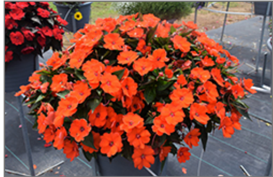
SunPatiens Compact Electric Orange New Guinea Impatiens in bloom

SunPatiens Compact Electric Orange New Guinea Impatiens is a fine choice for the garden, but it is also a good selection for planting in outdoor containers and hanging baskets. It can be used either as 'filler' or as a 'thriller' in the 'spiller-thriller-filler' container combination, depending on the height and form of the other plants used in the container planting. It is even sizeable enough that it can be grown alone in a suitable container. Note that when growing plants in outdoor containers and baskets, they may require more frequent waterings than they would in the yard or garden.