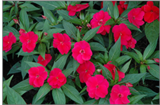
Divine Cherry Red New Guinea Impatiens flowers