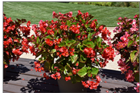
Whopper Red Green Leaf Begonia flowers