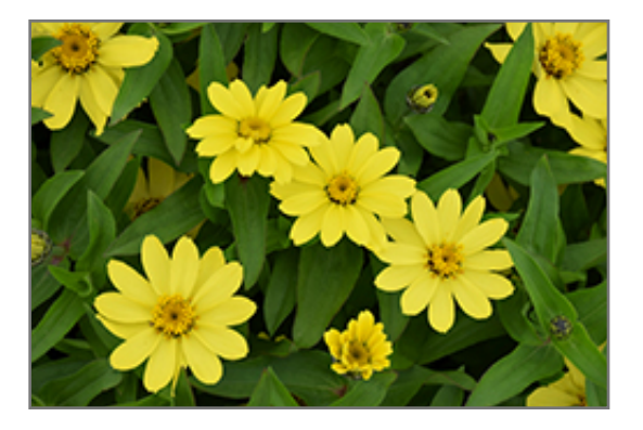
Zahara Yellow Zinnia flowers

Zahara Yellow Zinnia is recommended for the following landscape applications;