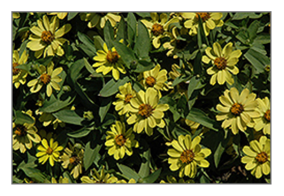
Zahara Yellow Zinnia flowers

8424 Farley St. Overland Park, KS 66212 913.642.6503