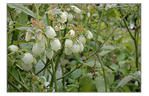
Bluecrop Blueberry flowers

Aside from its primary use as an edible, Bluecrop Blueberry is sutiable for the following landscape applications;