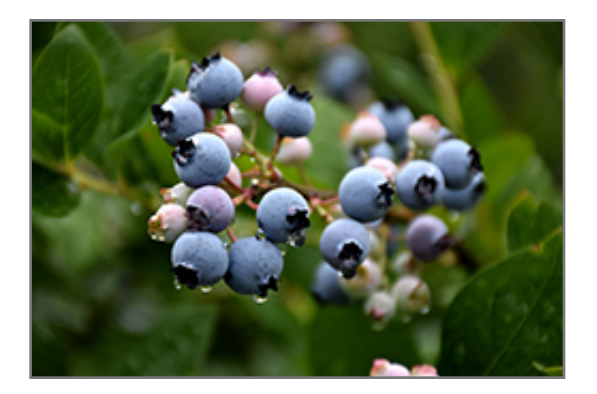
Bluecrop Blueberry fruit

Bluecrop Blueberry features dainty clusters of white bell-shaped flowers with shell pink overtones hanging below the branches in mid spring. It has green deciduous foliage. The glossy oval leaves turn yellow in fall. It features an abundance of magnificent blue berries in mid summer. The smooth brick red bark adds an interesting dimension to the landscape.