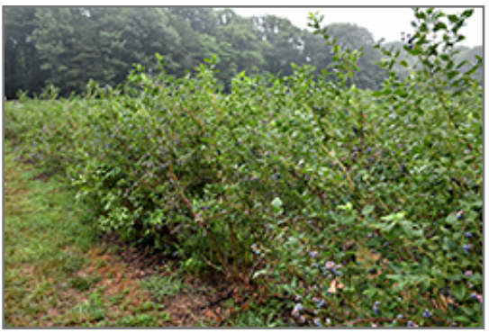
Bluecrop Blueberry fruit

8424 Farley St. Overland Park, KS 66212 913.642.6503