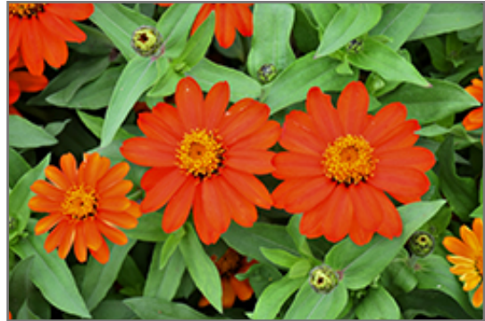
Zahara Fire Zinnia flowers

Zahara Fire Zinnia is recommended for the following landscape applications;