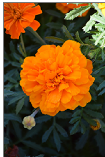
Safari Tangerine Marigold flowers