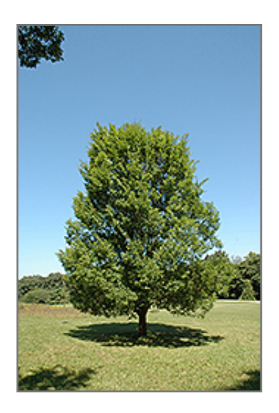
Allee Elm

830 W Liberty Dr. Liberty, MO 64068 816.781.0001