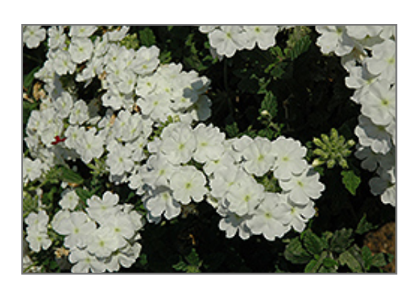
Empress Flair White Verbena flowers