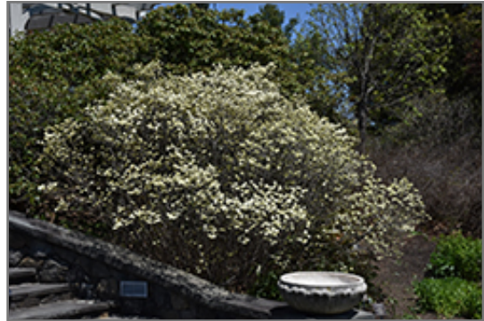
Dwarf Fothergilla in bloom

Dwarf Fothergilla is recommended for the following landscape applications;