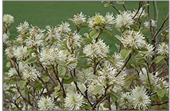
Dwarf Fothergilla flowers

This shrub does best in full sun to partial shade. It requires an evenly moist well-drained soil for optimal growth, but will die in standing water. It is not particular as to soil type, but has a definite preference for acidic soils, and is subject to chlorosis (yellowing) of the foliage in alkaline soils. It is somewhat tolerant of urban pollution. This species is native to parts of North America.