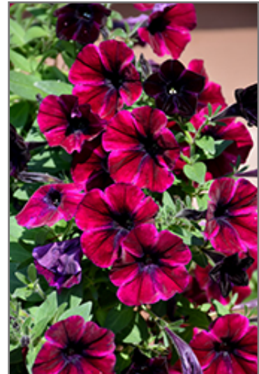
Sweetunia Johnny Flame Petunia flowers