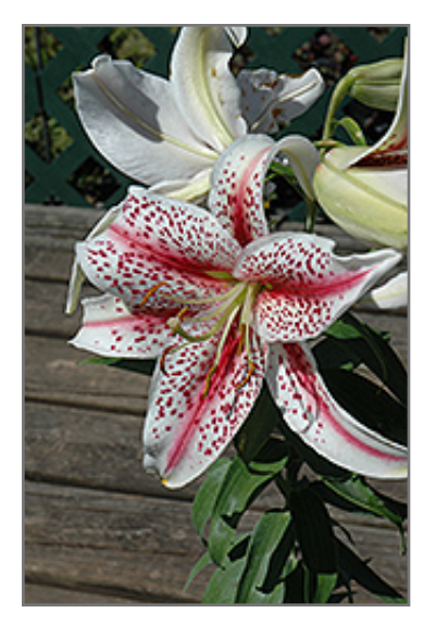
Tiger Woods Lily flowers

830 W Liberty Dr. Liberty, MO 64068 816.781.0001