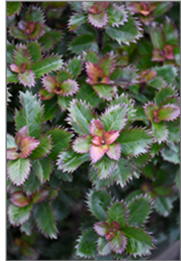
Sallywag Holly foliage