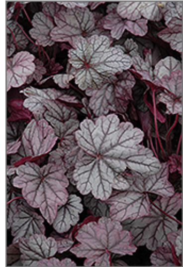
Carnival Sugar Plum Coral Bells foliage

This is a relatively low maintenance plant, and should be cut back in late fall in preparation for winter. It is a good choice for attracting hummingbirds to your yard. It has no significant negative characteristics.