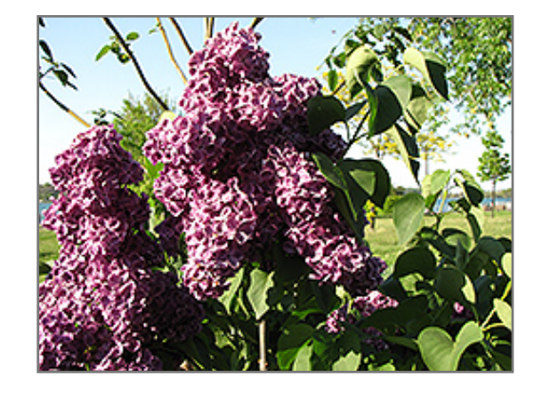
Monge Lilac flowers

830 W Liberty Dr. Liberty, MO 64068 816.781.0001