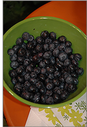
Peach Sorbet Blueberry fruit

This shrub is quite ornamental as well as edible, and is as much at home in a landscape or flower garden as it is in a designated edibles garden. It does best in full sun to partial shade. It does best in average to evenly moist conditions, but will not tolerate standing water. It is very fussy about its soil conditions and must have sandy, acidic soils to ensure success, and is subject to chlorosis (yellowing) of the foliage in alkaline soils. It is quite intolerant of urban pollution, therefore inner city or urban streetside plantings are best avoided, and will benefit from being planted in a relatively sheltered location. Consider applying a thick mulch around the root zone in winter to protect it in exposed locations or colder microclimates. This particular variety is an interspecific hybrid.