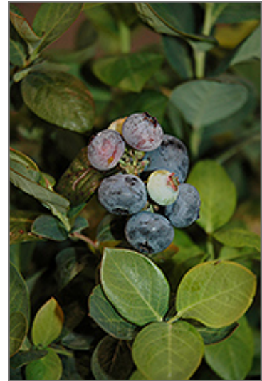
Peach Sorbet Blueberry fruit

Peach Sorbet Blueberry features dainty clusters of white bell-shaped flowers hanging below the branches in mid spring. It has green evergreen foliage. The glossy oval leaves turn an outstanding deep purple in the fall, which persists throughout the winter. It features an abundance of magnificent blue berries from early to mid summer.