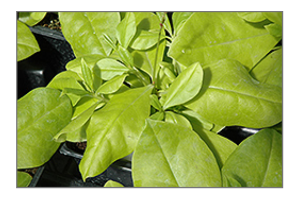
Limon Jewels Of Opar foliage

830 W Liberty Dr. Liberty, MO 64068 816.781.0001