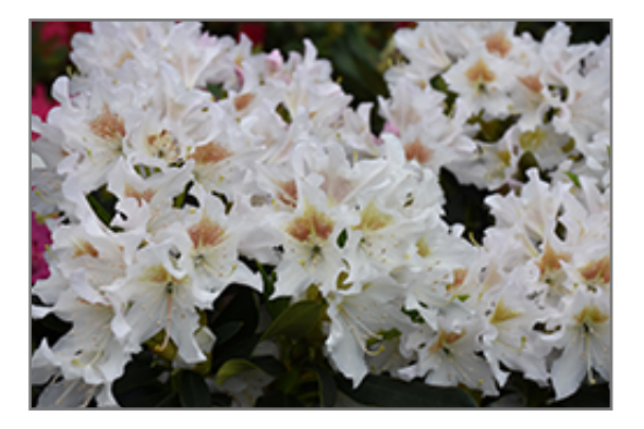
Cunningham's White Rhododendron flowers