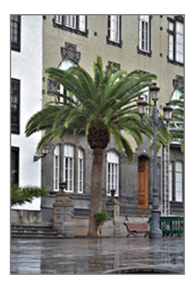
Canary Island Date Palm

This tree does best in full sun to partial shade. It does best in average to evenly moist conditions, but will not tolerate standing water. It is not particular as to soil type or pH. It is somewhat tolerant of urban pollution. This species is not originally from North America.