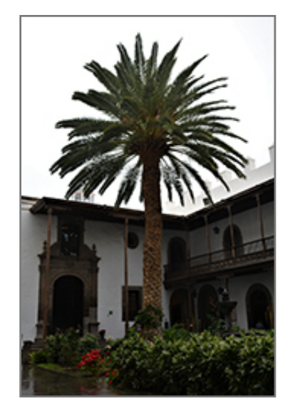
Canary Island Date Palm

Canary Island Date Palm is recommended for the following landscape applications;