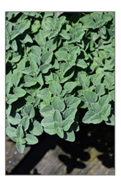
Hot And Spicy Oregano foliage

Aside from its primary use as an edible, Hot And Spicy Oregano is sutiable for the following landscape applications;