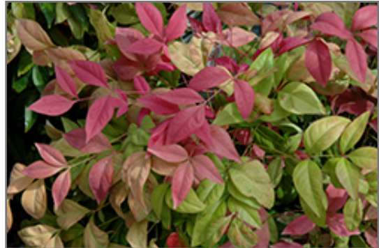
Blush Pink Nandina foliage

Blush Pink Nandina is recommended for the following landscape applications;